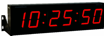
[DDU-TM] - IP20