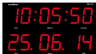
[DDU-TD] - IP20